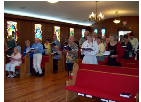
The 42 members present close the service with the final hymn, Sweet Hour of Prayer .